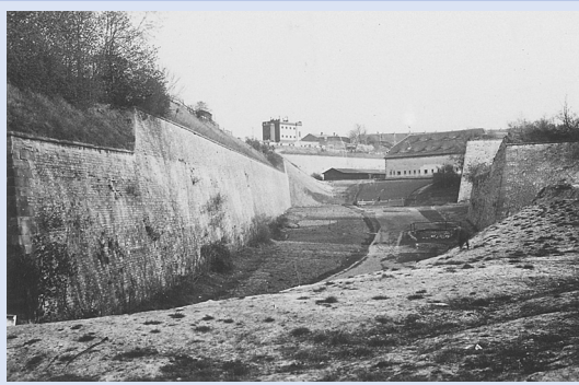
Around 1915. Left: Bastion Michael (development time 1685-1695). Right: Lunette No. 2, behind it Ravelin Anselm and Gun Caponier-No. 1. In the background: excavated earthworks above the walls were thrown into the castle moat.