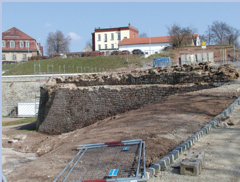
March 2009. In the earth hidden wall is still in good condition. With the wall in front (now lower) the existing wall, built in former city wall, was reinforced.