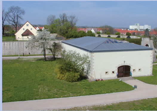
May 2006. View after complete renovation and approach to the original cubic volume by replacing the ailing, lofty roof by a flat roof.