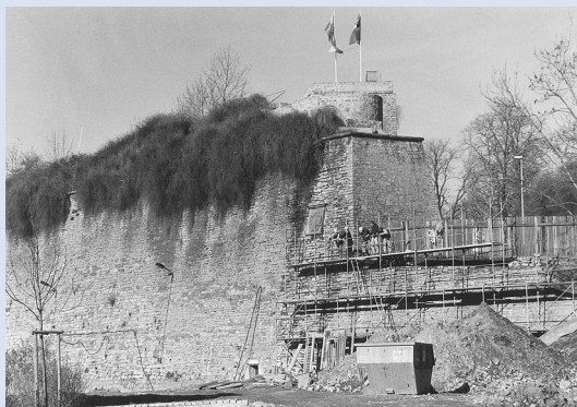
April 2000. Restoration of Bastion Martin. With the construction of the Bastions Martin, Kilian and Leonhard (from 1665 to 1673) the fastening of the Petersberg city-side began.