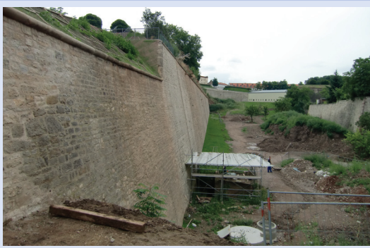
August 2010. The restoration of the bastion wall is completed. Finally, the lower fortress round trip and the terrain are designed.