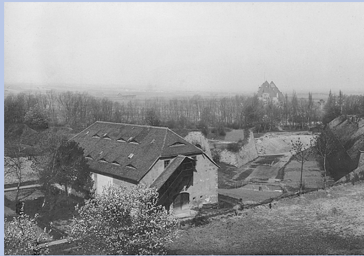
1914. View of the Gun Caponier No. 1 located in the fortress moat. This was built in 1823-1826 from stones of St. Peter's Monastery and originally stocked with bomb-proof earth. 1873 it was fitted with brick hipped roof and an external staircase to the newly created upper floor.