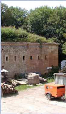
July 2009. Die unchanged Gun Caponier No. 2 illustrates the original appearance of both Caponiers.