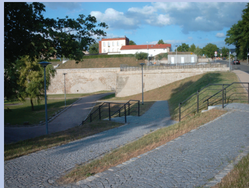
August 2010. The restoration of walls is completed. Similarly, the adjacent site was designed with a staircase and barrier-free pathway in of the castle moat.