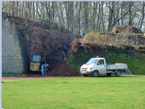
April 2008. Beginning of the partial exposure of 1874 in the course of leveling work spilled bastion walls. Construction of the Bastion Gabriel between 1680 and 1695.