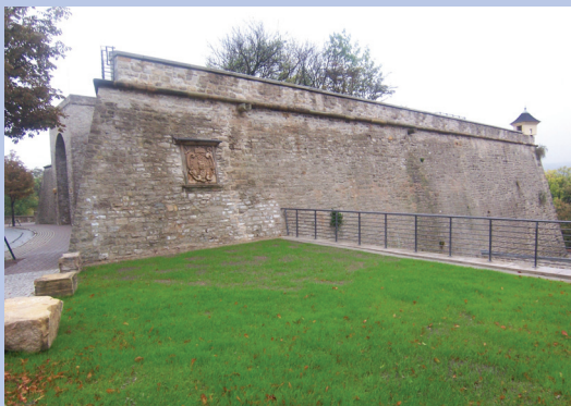
September 2007. View to Bastion Martin from Lauentorstrasse.