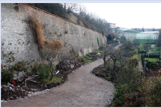
December 2005. Still the last since 1920 applied gardens in the fortress moat exist.