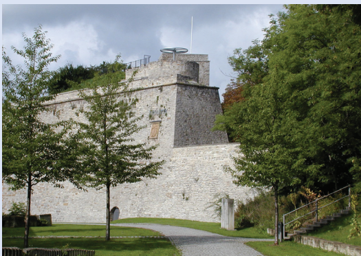
September 2010. Since the 1920s, a viewpoint is located on the Bastion Martin.