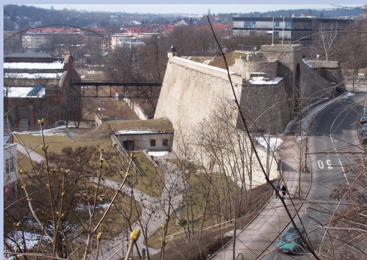
March 2006. View to Bastion Martin and the lower fortress round trip.