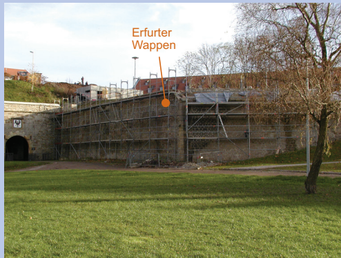
November 2009. Restoration.