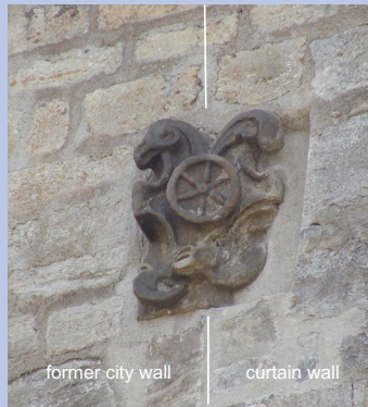
September 2010. Erfurt coat of arms on the corner of the former city wall. In 2010 it was restored and worked out.