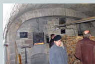
April 2008. Baking day.