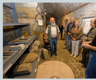
September 2008. Pilot presentation of an exhibition on traditional fortress construction technologies.

Powder Magazine with vaulting of the circumferential trench