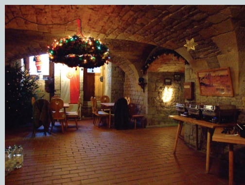
Christmas 2007. The premises of the fortress bakery are popular for company and family celebrations.

In 1832 in the Eastern side Caponier of the Defense Barracks a War or Fortress Bakery was set up. With the two ovens daily up to 400 breads were baked. The Bakery was set up defensible with six infantry loopholes and additional reinforcement in the area of access doors. In 1995 there was a re-commissioning. Erfurt citizens and tourists can purchase "fortress bread" here on at regular intervals.