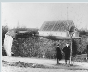
Around 1910. View from South East.