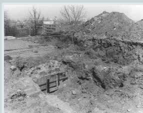
April 1996. Exposure of the entry to the Fortress Bakery.