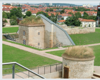
August 2010. Bastion Franz. View of War Powder Magazin No.1 from South West.