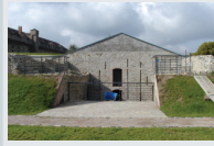
September 2010. View from North East.

Construction phases: 1726/28 construction of War Powder magazine No. 1