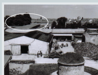
1996. Huts at Bastion Johann.