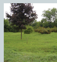
June 2009. Bastion Michael. This is where an adventure playground will be set up in future.