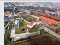
2007. Bastion Leonhard with visitor information center and gastronomy.