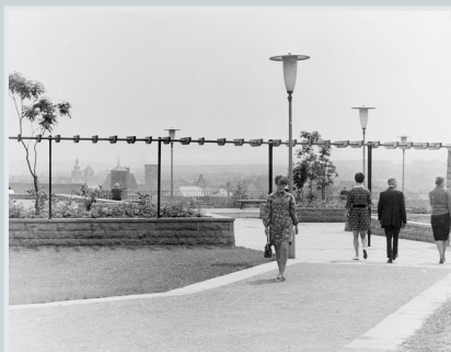
1969/70. Viewing platform at Bastion Leonhard.