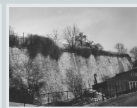
June 1965. Bastion Leonhard.