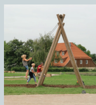
August 2010. Middle Plateau in front of the Fortress Bakery.