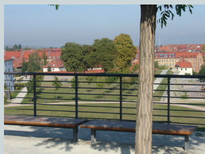
September 2006. The Citizen's Garden is inviting everyone.