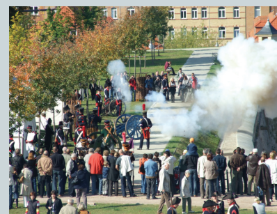
September 2006. Citizen's Garden as place for events.